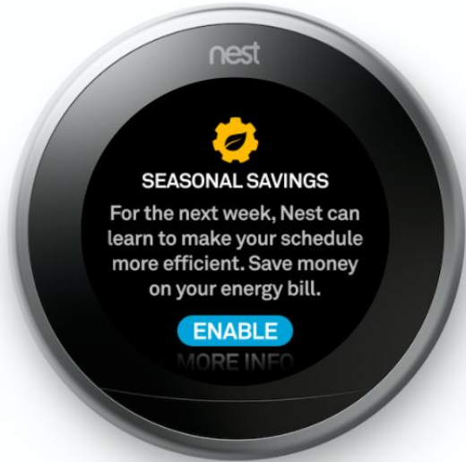
Energy Efficiency Save kWh & therms