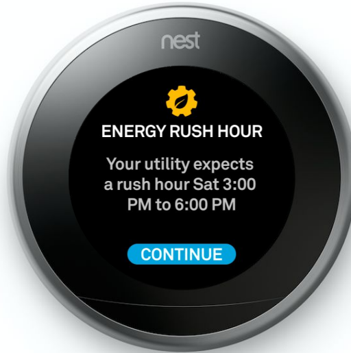
Demand Response Shift kW